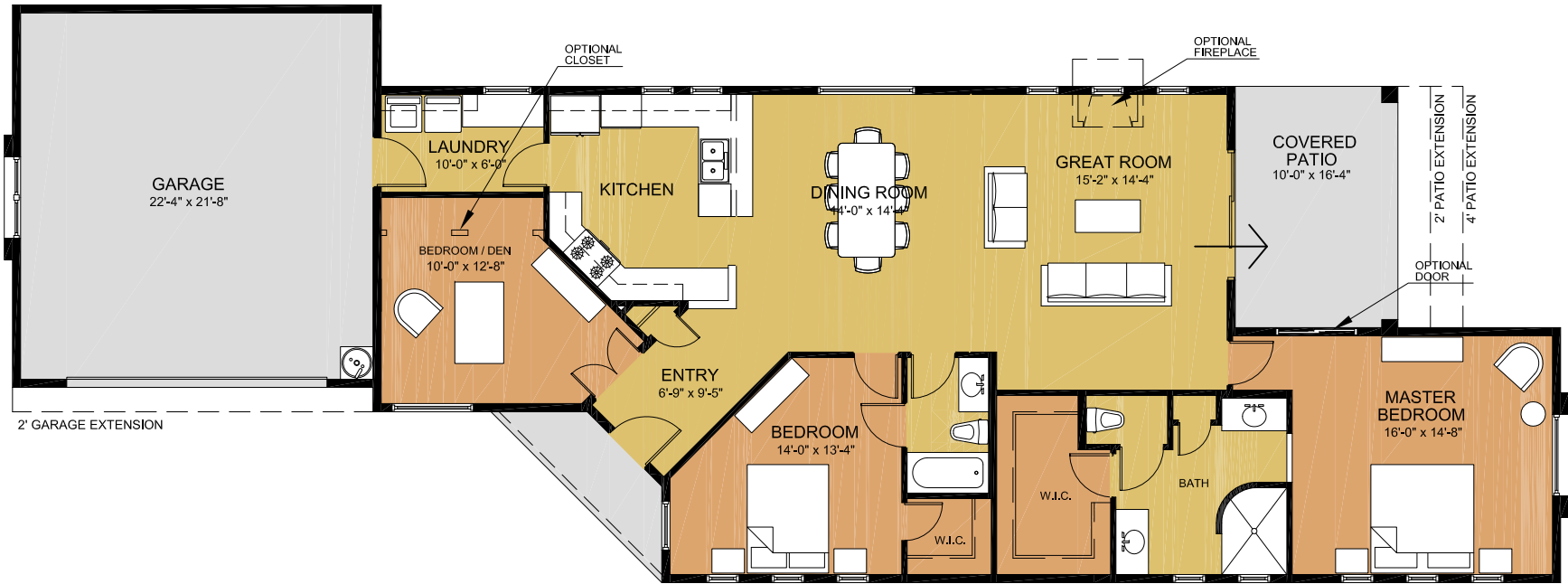
BASE FLOOR PLAN

35' wide | 96'-2" deep | 1756 sq.ft. | 2 beds | 2 baths | 2 cars